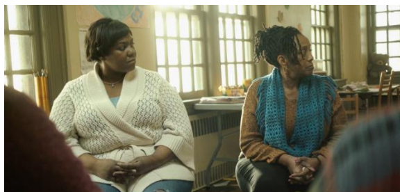
Figure 6. The existence of the support group

Based on this datum, it indicates that the shelter that provides Sadies a safe place to speak out and social community that movie has saved and when she was helpless because of the had. “The shelter was