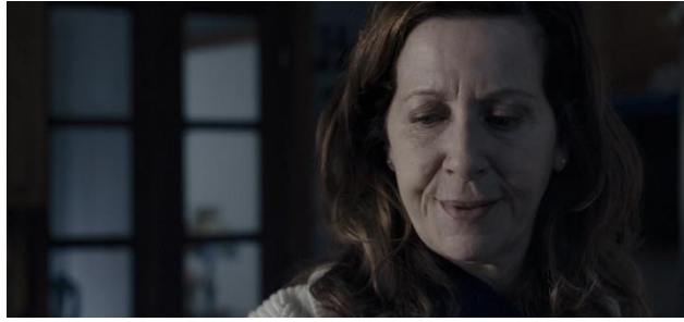
Figure 1. Sddie suggests the victim go to the group

Sddie, who acts as the helper to the poor victim symbolically shows a community group as the safe place. This means that the existence of group, shelter, or organization is important for human beings to share what they feel and experience and support each other to reach one big purpose. Collective consciousness gives human beings a picture about condition and situation that they face and challenge together.