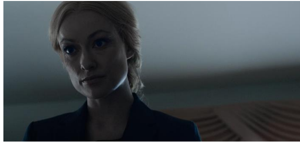
Figure 2. Sadies's effort to help the victim of domestic violence

Sadies comes to help the helpless victims by showing her motif to support and assist the victims to get the justice and equality in the structure of the society. Sadies indicates and represents the social community as the support system for the victims who have endured and shared the same things in their families because they likely seem helpless and powerless to fight back. Sadies's assistance encourages and heartens the victim not to hold back against injustice, physical abuse, intimidation, and domestic violence. Sadies, who is one of the important roles in the social community depicted in the movie represents her message and direct support and her social community as the place to assist the victims.